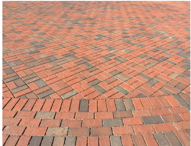
Photo 2 Permeable Clay Pavement

Reducing the Heat Island Effect. Building and pavement surfaces can have a warming effect on surrounding air temperatures, particularly in urban areas. One strategy that can be used to help reduce this heat island effect is to use materials that have a three-year aged solar reflectance (SR) of 0.28 or higher on pavements and walkways on the building site, or even on vegetated roofs to provide access paths to reduce this effect. Though lighter colors often are associated with high SR values, many brick pavers, even some that are dark in color, can meet this requirement. [LEED 2009 SS credit Heat Island Effect; LEED v4 SS credit Heat Island Reduction; ASHRAE 189.1 Sec. 5.3.5.1; IgCC Sec. 408 and A104.9; LEED-Homes SS credit Heat Island Reduction; ICC 700 Sec. 505.2]