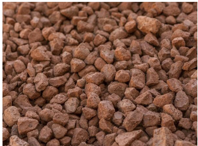
Photo 3 Recycled Brick Chips

Construction Waste and Recyclability. Building construction can generate significant amounts of waste. Because of the small, modular nature of brick, on-site construction waste can be dramatically reduced through careful design and detailing. Packaging from brick is minimal and easily recycled. Brick can be recycled in many ways. Scrap brick and brick from demolition can be crushed and recycled into new brick or used as brick chips for landscaping (see Photo 3 ), baseball diamonds and tennis courts. Recycled brick also can be used as sub-base material for pavements, on quarry roads or even as aggregate for concrete. Green building programs encourage the recycling of construction waste and minimization of total waste generated. [LEED 2009 MR credit Construction Waste Management; LEED v4 MR credit Construction and Demolition Waste Management; ASHRAE 189.1 Sec. 9.3.1; IgCC Sec. 503, A105.1 and A105.2; LEED-Homes MR credit Construction Waste Management; ICC 700 Sec. 601.3, 605 and 11.605]